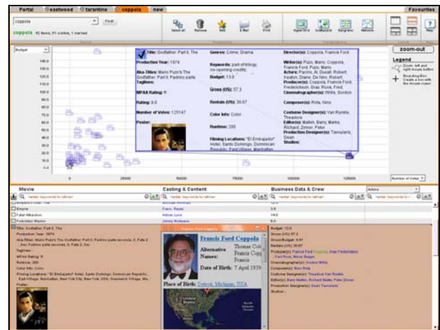
Figure 1. MedioVis: Multiple Coordinated Views with HyperScatter (top) and HyperGrid (bottom).

An information seeking process is often a combination of several searches. The user must be able to switch between different search paths without losing the afore gathered information. To support this non-linear search strategy, we integrated a tab concept, similar to multiple document interfaces.