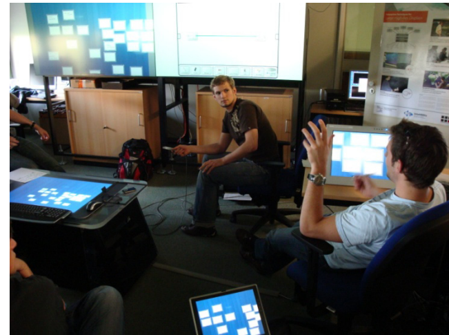
figure 2. Beyond-the-desktop technologies may provide the infrastructure for supporting the physical, cognitive and social aspects of artifact-mediated collaboration.

pen input and different modalities to facilitate sketching and annotations in group sessions [5]. Efforts to improve accessibility of digital artifacts for co-located collaboration like cross-device workspaces [1,12] as well as groupware for design [13] are promising. It was also shown with tools like Cabinet 1 and Outpost [7] that combinations of digital technology with material artifacts can make collaborative design more tangible. While many of these approaches focus on technical infrastructure or are specific to certain tasks, we argue that an activity-centered approach that is based on basic requirements for artifact-mediated collaboration can be successful in a variety of design activities.