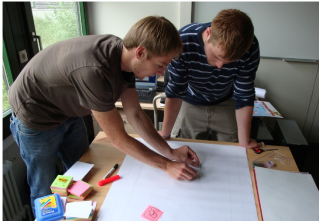
figure 1. Interacting with physical artifacts during collaborative ideation activities. Note how the nature of material artifacts facilitates group interaction but also makes them hard to share and archive.

Cognition has traditionally been regarded as the outcome of internal cognitive processes manipulating mental representations [9]. However, it has been shown [6] that cognition cannot be separated from the material and social environment. In many cases, like collaborative design, cognition is distributed among environmental properties and individuals. Social interactions between designers are often accompanied by indirect communication via artifacts for high-level activities like coordination and group reflection [8].