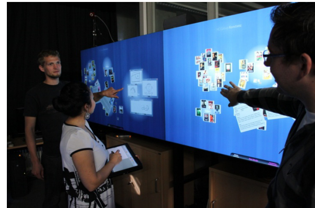
figure 3. Spatial positioning and scaling of artifacts on a zoomable pin board allows for different arrangements like timelines or process maps for cooperative reasoning. The visualization on an interactive whiteboard allows viewing, navigating, annotating and gesturing on artifacts.

within individual and collaborative reflection and synthesis phases [4]. Within our virtual pin board we explore spatial arrangements that support designers in these tasks over a range of activities throughout the process (e.g. timelines, process maps, affinity diagrams). We believe that integrating a variety of artifacts from sketches, pictures and videos or even prototype simulations into our interactive visualizations will improve flexibility of use. As the number of artifacts may become extensive, we integrate advanced zooming techniques to navigate on the virtual pin board.