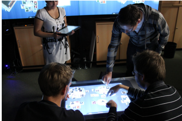
figure 4. Interacting with digital artifacts on an interactive tabletop. The affordances of multi-touch technology invite similar interactions as material representations and provide a hands-on experience when sorting, aligning or scaling artifacts.

build our tool around a physical setting similar to a design studio (see figure 2). As one important characteristic of a real design studio is physical display space, our computation-augmented design studio features several large, high-resolution interactive displays in the form of two tabletops and one large interactive whiteboard with pen interaction. For individual work, we integrated graphic tablets and tablet PCs.