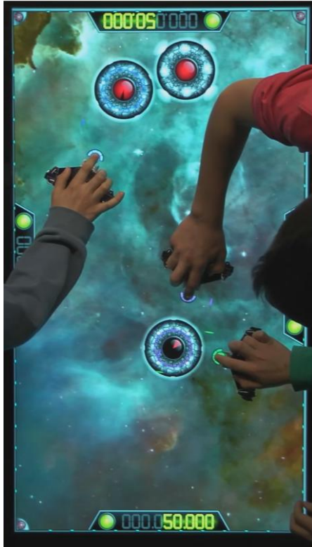
Figure 1: Children playing the game. Players have the task to collaboratively defend the earth against alien invaders. They can either attack on their own (player to the left) or work together (players to the right) to be more efficient, thus collaboration is only encouraged and not enforced.

manifestations, which are referred to as "autism spectrum disorders" (ASD). Children with ASD have impairments in social interaction and communicative skills and show stereotyped or repetitive behavior [1]. ASD can be recognized at all levels of intelligence. ASD's are not curable. Intervention strategies focus on decreasing symptoms by improving everyday interactions. In behavioral therapy, positive reinforcement is used in order to train desired behaviors. An easy way to provide this reinforcement is through so called "therapeutic games" or "health games". The effectiveness of such games can be improved by hybrid technology. Games based on such technology are often referred to as "hybrid games", which have the means to blend together digital and analog advantages [9], such as haptic and social elements of analog games and audiovisual possibilities of digital games. This combination of analog and digital advantages can now be used for therapeutic games for children with ASD. Recent studies [4, 6, 12] prove the potential of using hybrid interactive surfaces [7] for therapy games to help in treating HFA and AS. There is reason to assume that players are motivated and feel secure in the digital setting [12]. At the same time, the form factor allows face-to-face communication between the players thereby fostering real-life social interaction. Children with ASD might "benefit from the social computing experience provided by tabletop technology" [12].