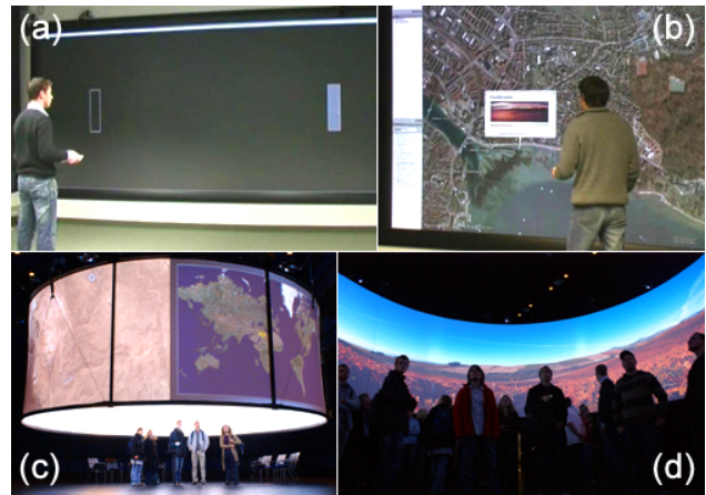
Figure 2: Unidirectional tapping test (a) and Google Earth at the 221" Powerwall (b), artistic installation »Globorama« (c,d).