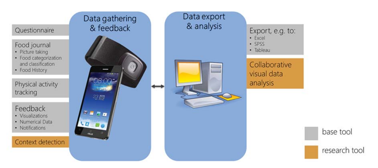
Figure 1: Components of the toolsbox