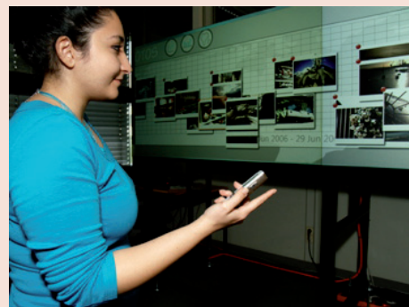
Demonstration of finteraction method in our Media Room.

Jenabi, Mahsa, Reiterer, Harald: Finteraction - Finger Interaction with Mobile Phone, NordiCHI'08: Future Mobile Experiences (a Workshop at NordiCHI), Lund, Sweden, NordiCHI 2008, Oct 2008.