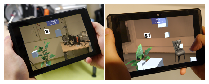
Figure 2. In addition to the work objects (cubes) several objects (e.g., a plant) are available and can serve the collaborators as SVLs in relation to which other work objects can be defined.

Similar to Müller et al. [24] we designed a collaborative version of the memory card game to evoke spatial referencing between collaborators. Unlike in Müller et al.'s experiment [24], collaborators were located in spatially distributed rooms. This poses different challenges in terms of the "perceptual mechanisms used to maintain awareness" [16] during collaborative spatial referencing. We distributed 20 virtual cubes in