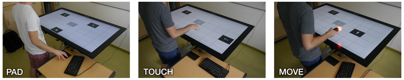
Figure 1. Our three different input modalities PAD, TOUCH, and MOVE used on LARGE

{johannes.zagermann,ulrike.pfeil,daniel.immanuel.fink,philipp.bauer,harald.reiterer}@uni-konstanz.de